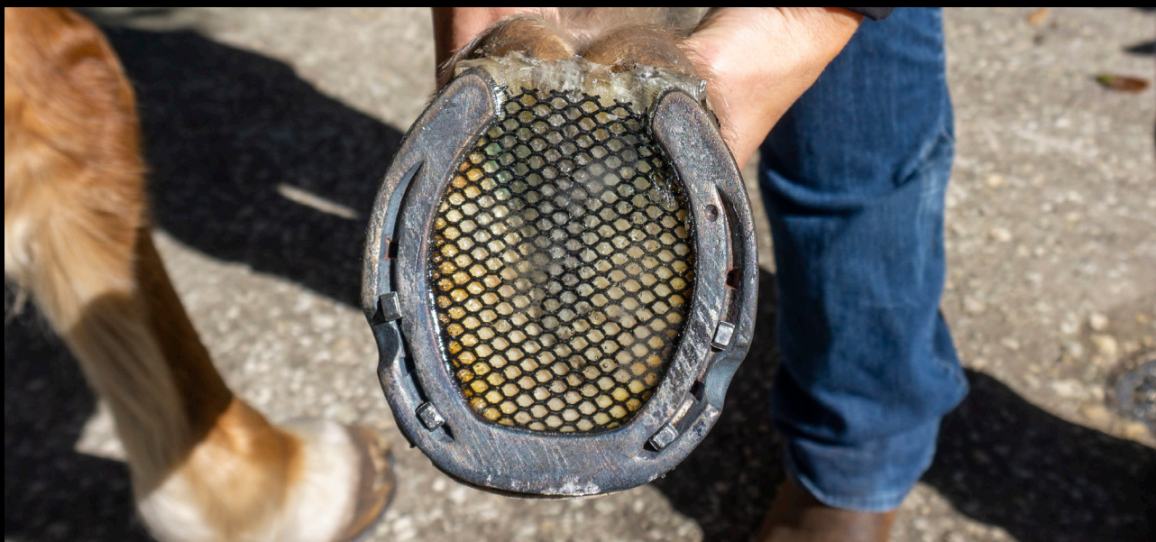
Shupack with mesh.