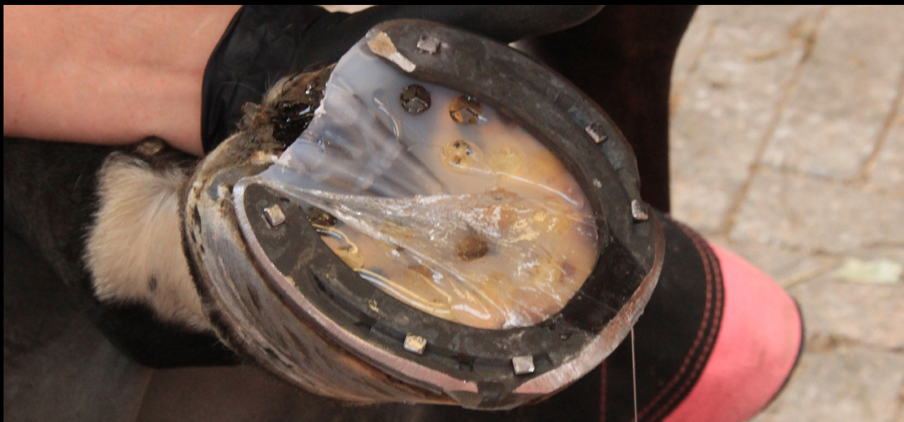
Shupack with pad.