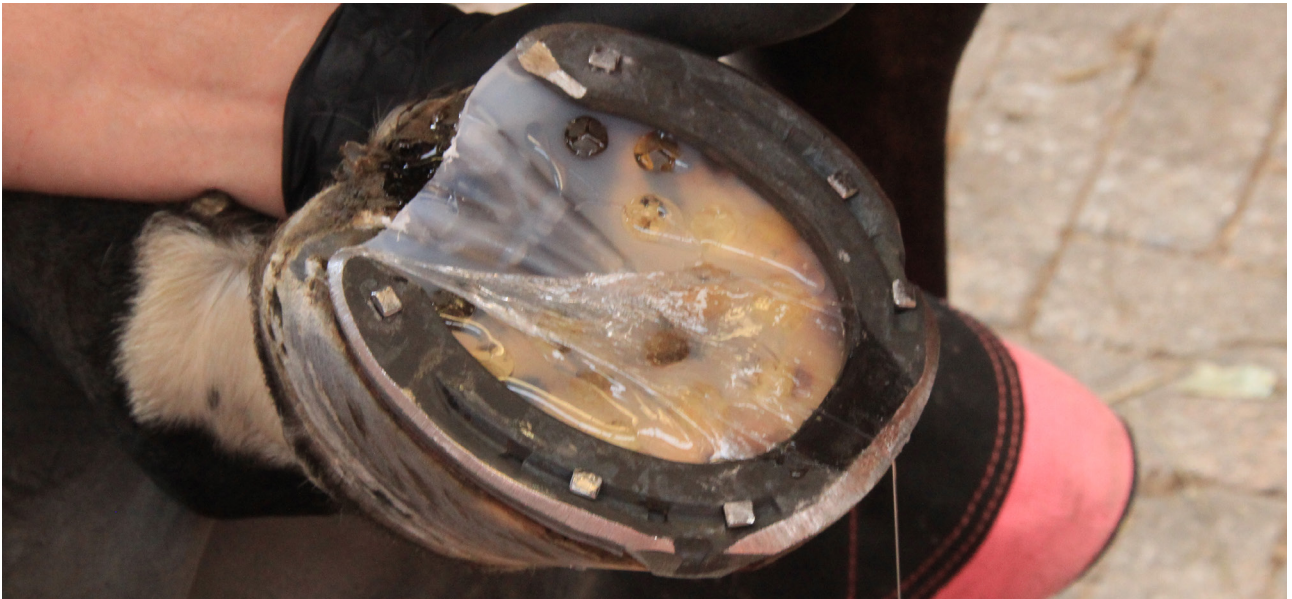
Shupack with pad.