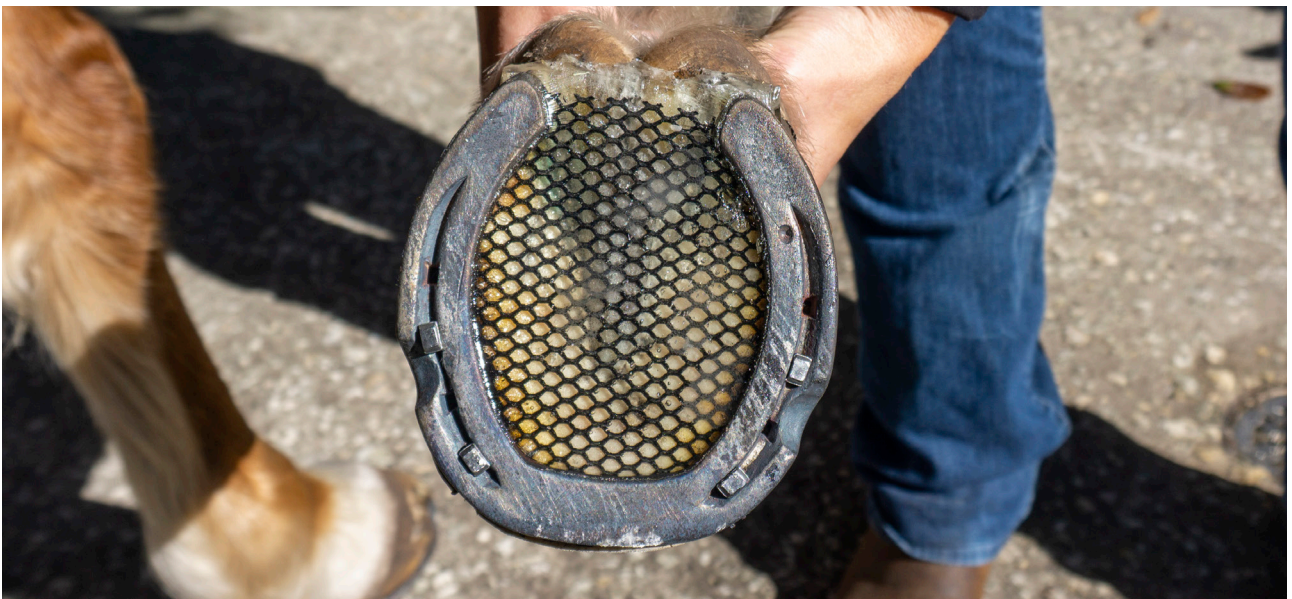
Shupack with mesh.